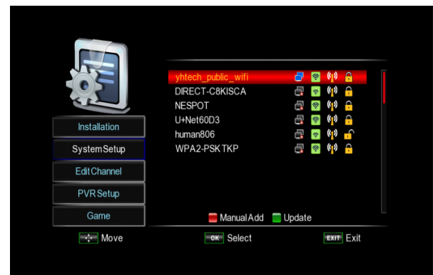
Figure A. Access Points for WiFi

To setup USB WiFi adapter, go to Network Setup and select Wireless as Link Mode. Press Config and then available access points(AP) will be displayed in the list as figure A.