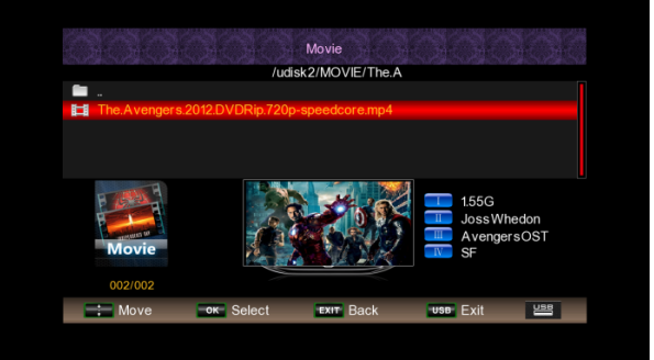
Figure 7.9 MOVIE on USB Media Player

MOVIE: Select MOVIE icon and press OK to enter the USB device. It shows all video files and previews the video that the cursor is on it. It supports formats such as MPG, AVI, VOB, DAT, ASF, MKV, RM, WMV, TSF, and QuickTime (QT).