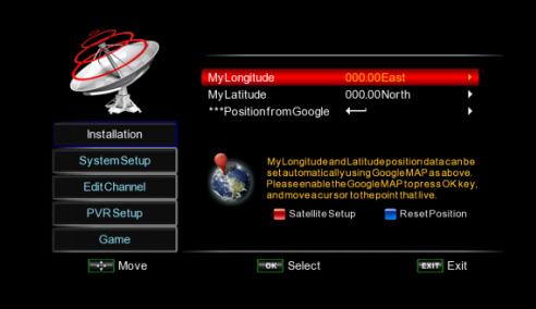
Figure 3.3 USALS Setup with Google MAP