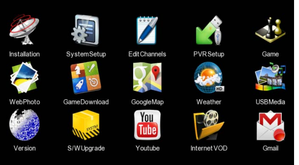
Figure 2.1 Main MENU

Press MENU key, it will display 15 subsidiary icons as below; This MENU provides 32bits colors & graphics, simple UI structure and user-friendly icons in usage of it like Smartphone.