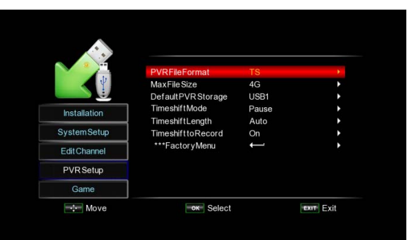
Figure 6 PVR Setup submenu