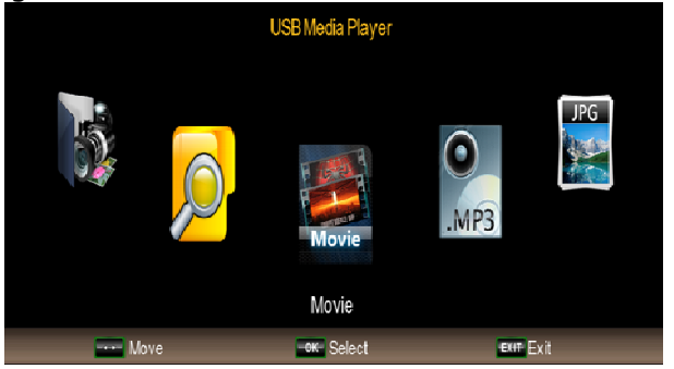
Figure 7.8 USB Media Player page

Select and play a movie, photo, music, EBook, etc from a list of them that are stored in the USB storage device.