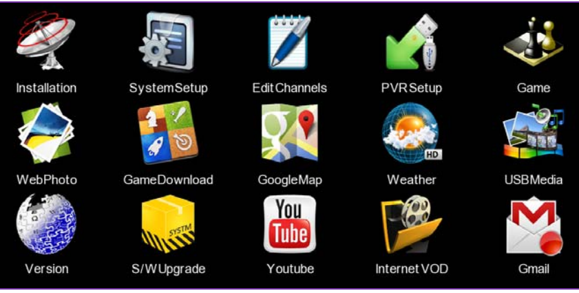
Main MENU of EYEBOX X5

YouTube/Internet VOD/Gmail/Gmap supported Digital HD Satellite Receiver