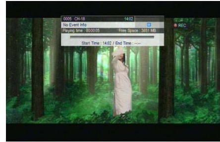
Figure 2.5 REC Initializing