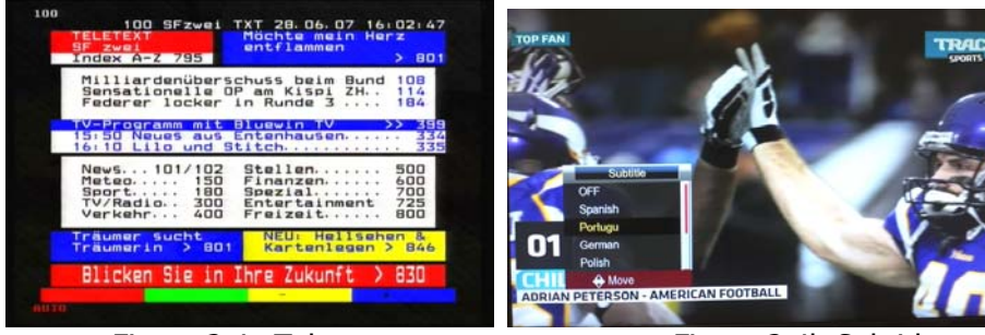
Figure 2.4a Teletext

j) Teletext & Subtitle : Press TXT (RED) or SUB (YELLOW) key, respectively. It will enable the function of Teletext and Subtitle as below, if available.