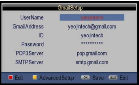
Figure 7.6 Gmail Setup

Gmail is a free, advertising-supported email service provided by Google. Users accesses Gmail as secure webmail, as well via POP3. In this s/w, Gmail is provided on embedded UI as below. Press Gmail icon in MENU and then, firstly setup menu will be displayed as figure 7.6.